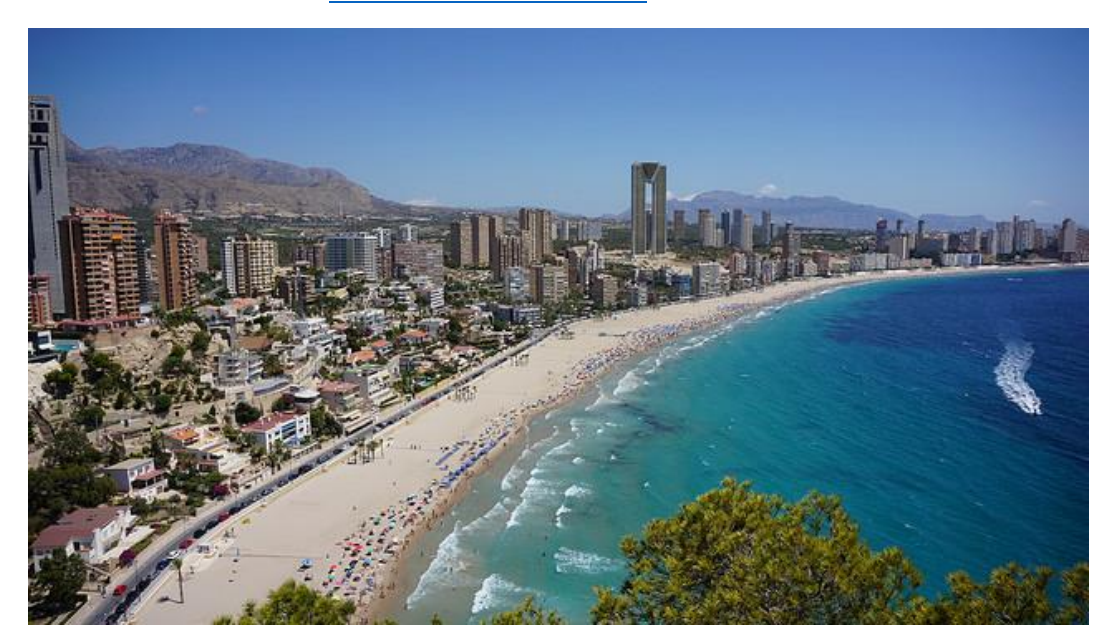
Villajoyosa offers some smaller shops that are nice to visit.

In central Benidorm you finds many of the big chains, such as Zara, Springfield and Mango but also lots of smaller shops. The shopping district is concentrated to the area behind Playa/Platja de Llevant and Playa de Poniente where the two beached meet. For more information visit <a href="https://www.benidormist.com">www.benidormist.com</a>.